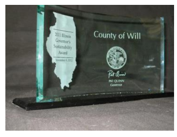
2011 and 2012 Awards

Since 1987, the Illinois Sustainable Technology Center (ISTC) has presented the Illinois Governor's Sustainability Award (Governor's